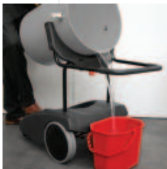
Tilting tank (Costellation IR 03)