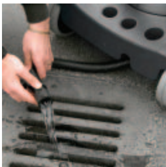
Drain hose system (Apollo IF 03)